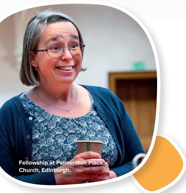
Fellowship at Palmerston Place Church, Edinburgh.

We are a part of God's creation. Across the year we give thanks for our food, and for all those who have grown and made it. We praise God for the fruitfulness of the earth. We also think of those in need and how we might help them. It's an example of 'paying it forward' – gratitude for the generosity we have received motivates us to share generosity with others.