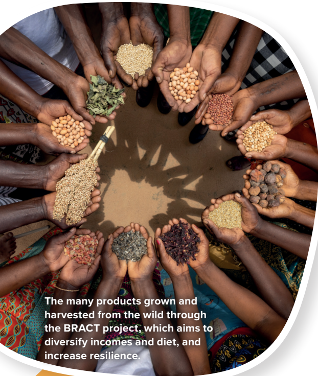
The many products grown and harvested from the wild through the BRAC project, which aims to diversify incomes and diet, and increase resilience.

The Bible is full of passages that speak to the values of generous giving. Leaving a gift in our Will can be a powerful expression of our faith and generosity.