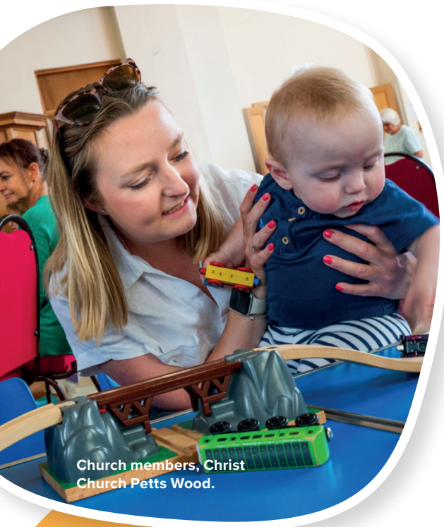
Church members, Christ Church Petts Wood.

Children will love the all-age 'Mighty oaks' talk which is based on Hebrews 11:1.